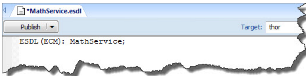
Figure 4. ESDL file

Notice that some text has been written for you in the window.