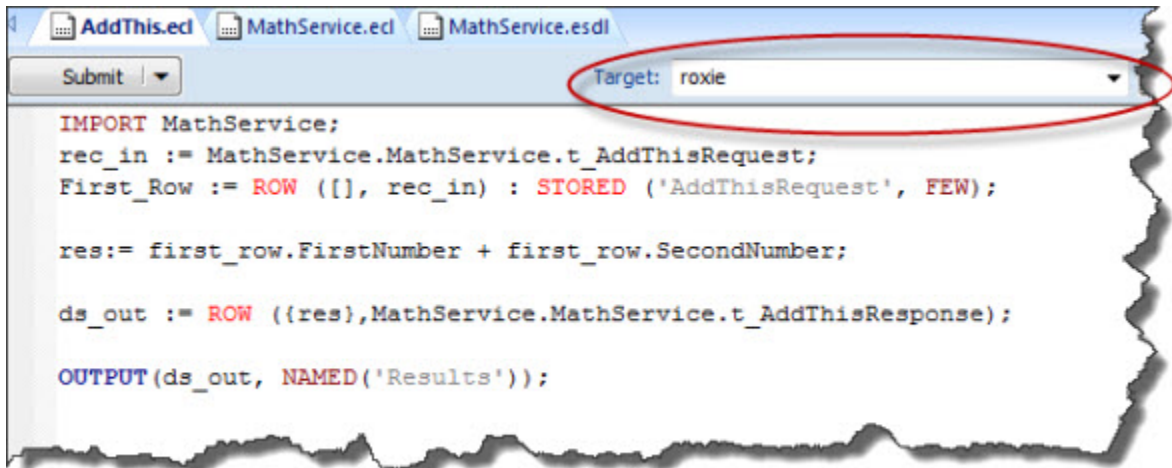
Figure 7. Target Roxie