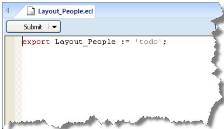
Figure 11. Layout People in Builder

Notice that some text has been written for you in the window. This helps you to remember that the name of the file (Layout_People) must always exactly match the name of the single EXPORT definition (Layout_People) contained in that file. This is a requirement -- one EXPORT definition per file, and its name must match the filename.