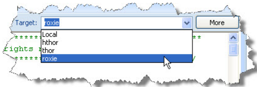
Figure 40. Target roxie