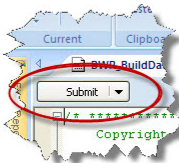
Figure 31. Submit button

Note: This file uses the previously generated data. It builds an index on one of those data files.