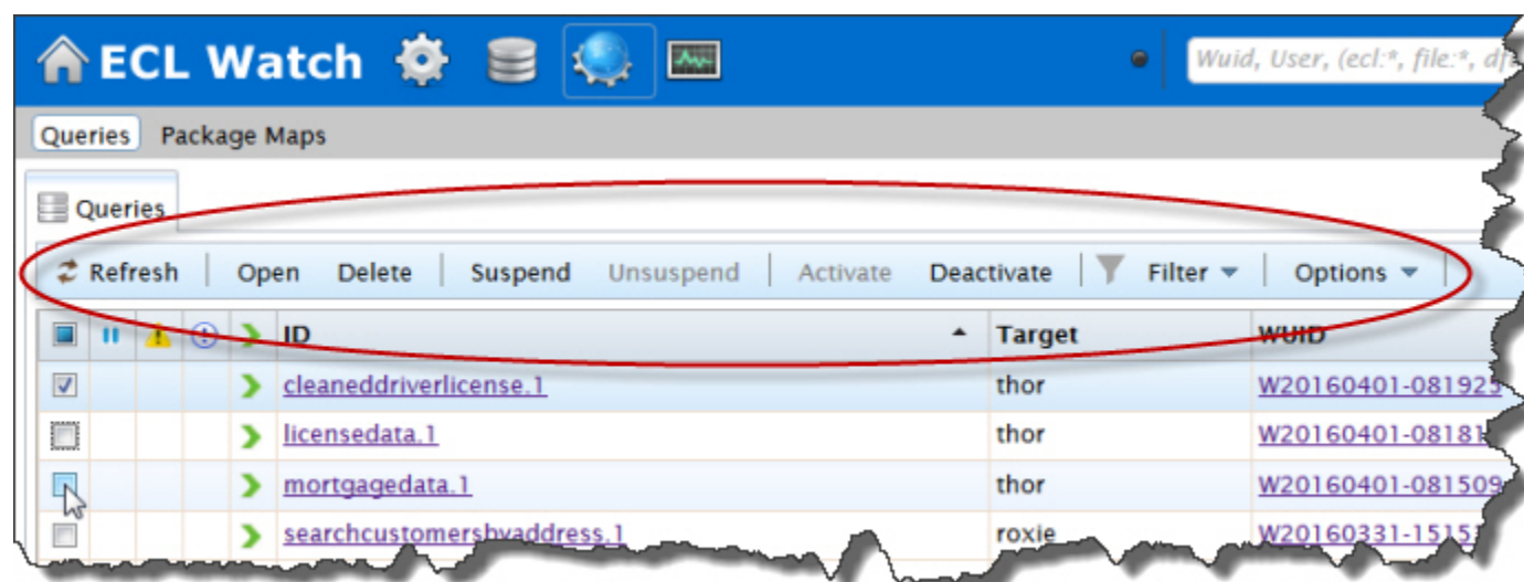
Figure 9. Published Query Action buttons

When you select the Published Queries hyperlink you open the Queries tab. This tab displays published queries on the system. The Action buttons allow you to perform operations on the published queries selected.