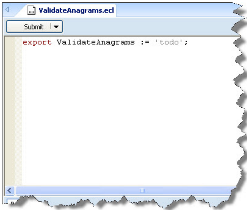
Figure 23. Builder Window