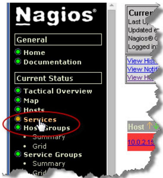
Figure 7. Nagios Services

The services link displays the Service Status details for the systems being monitored.