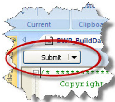
Figure 31. Submit button

Note: This file uses the previously generated data. It builds an index on one of those data files.