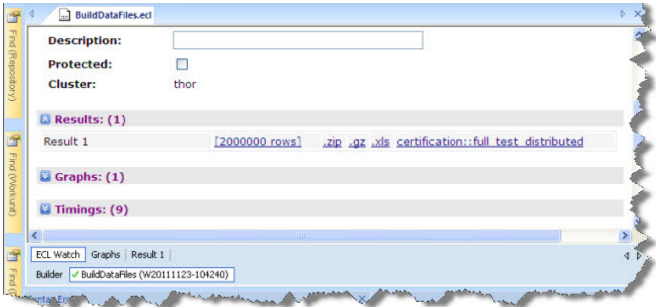
Figure 23. Workunit details page

Note: The filename and other variables are defined in the _Certification.Setup file.