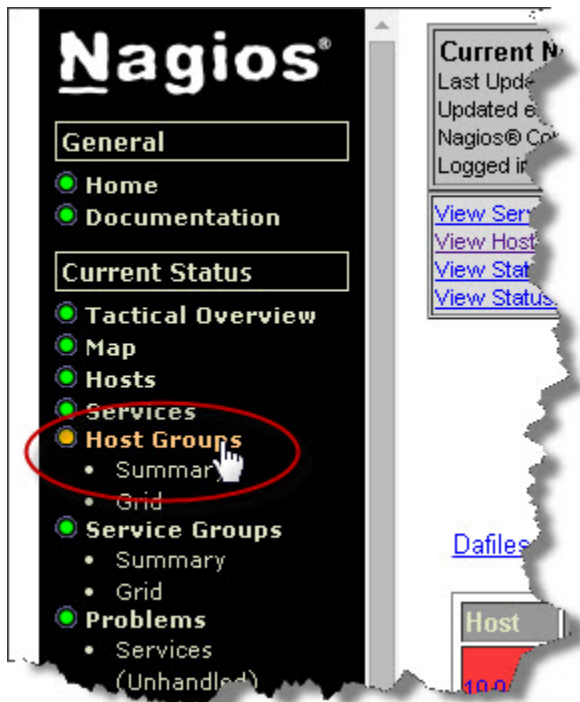
Figure 5. Nagios Host Groups

This displays the Host Groups being monitored.