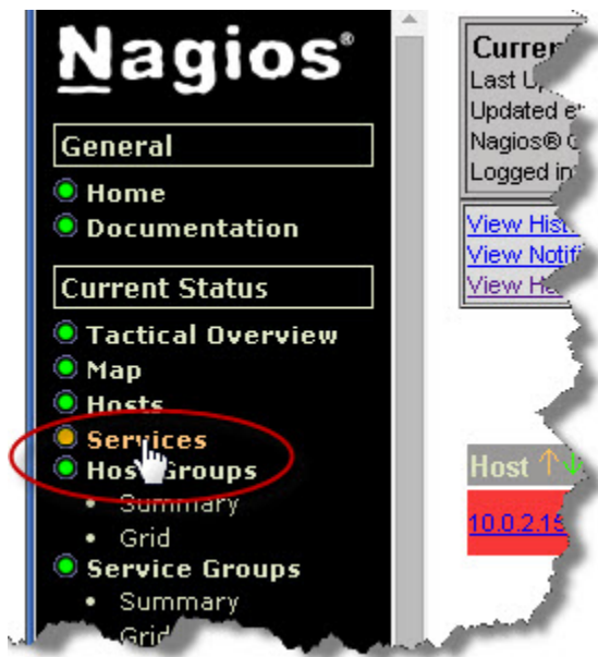
Figure 7. Nagios Services

The services link displays the Service Status details for the systems being monitored.