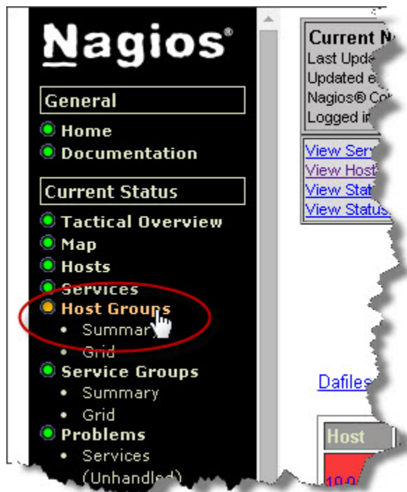
Figure 5. Nagios Host Groups

This displays the Host Groups being monitored.